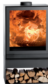
TQH 43 - Tall stand