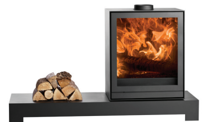
TQH 43 - Bench