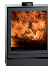
TQH 43 - Low stand